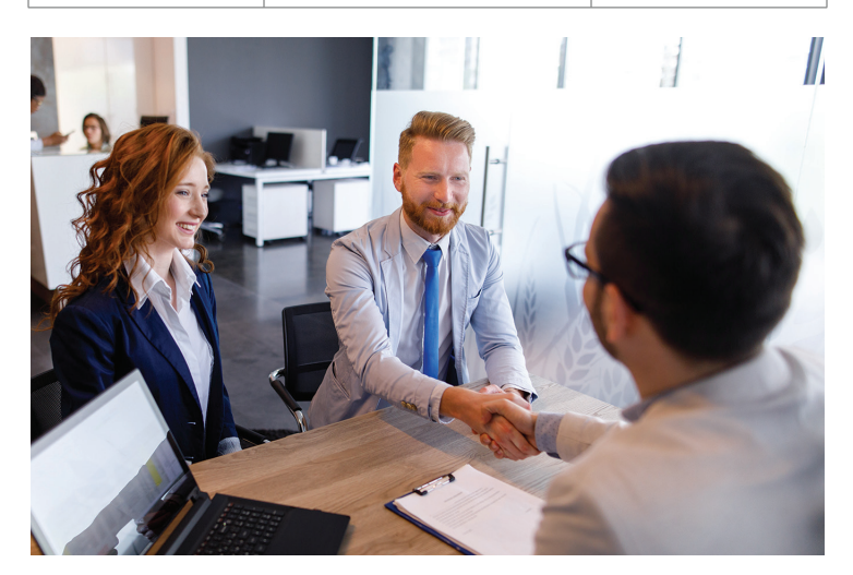
VIEW ONLINE AT: